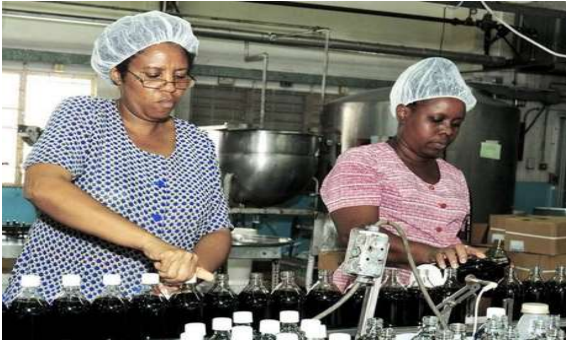
Figure 4: A Factory Production Line

Study Figure 4 which is a photograph showing a factory production line in Antigua and Barbuda and then answer the questions below.