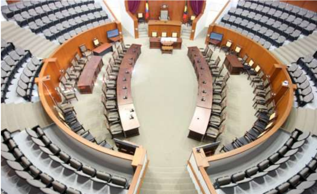
Figure 3: Parliament Chamber

Study Figure 3 which is a photograph showing the Parliament chamber and then answer the questions below.