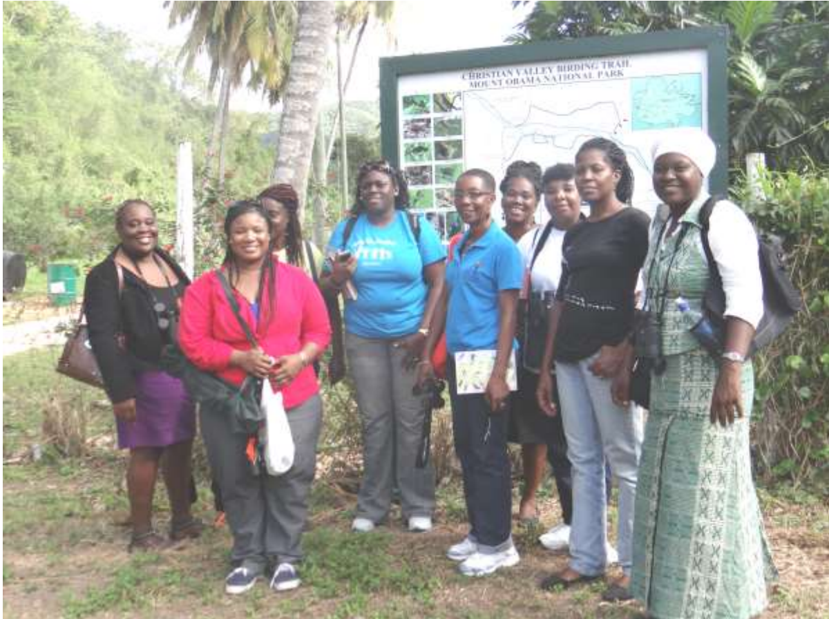
Figure 1: Teachers at Christian Valley Agricultural Station

Study Figure 1 which is a photograph showing teachers at Christian Valley Agricultural Station and then answer the questions below.