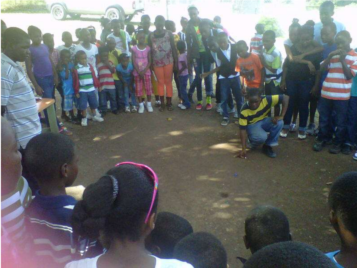
Figure 2: Students involved in a competition at a rural primary school

Study Figure 2 which is a photograph showing students involved in a competition at a rural primary school in Antigua.