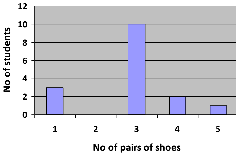
Graph showing pairs of shoes for students in Mr Oliver's Class

(a) Use this information to complete the bar chart: 5 students own two pairs of shoes . Draw the bar on the graph above.