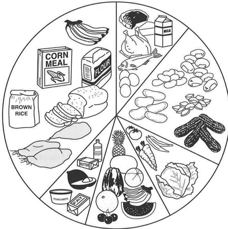
Figure 3. Caribbean Food Groups